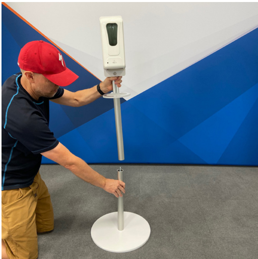
7) Screw in as shown.