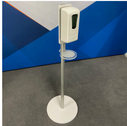
8) Stand is now assembled.