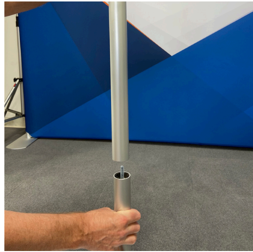
6) Now, screw round poles into each other.