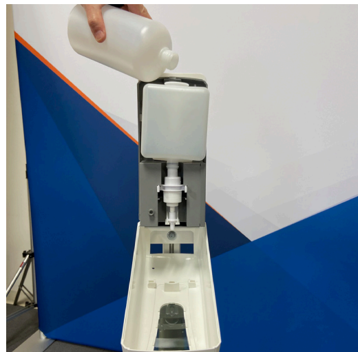
10) Open cap and pour sanitizing liquid in.