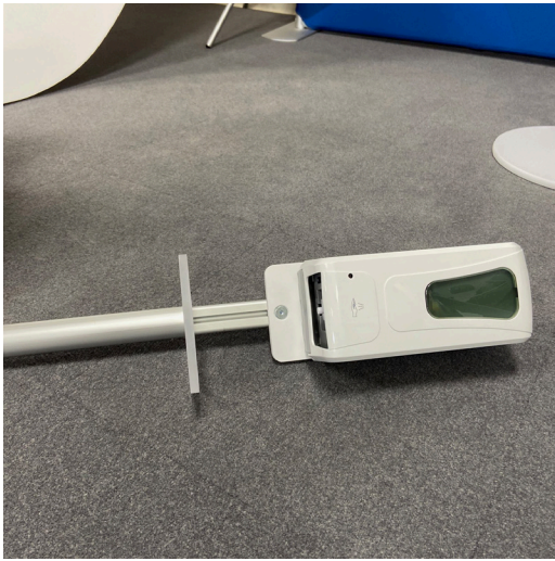
5) Hand tighten until firmly secure.