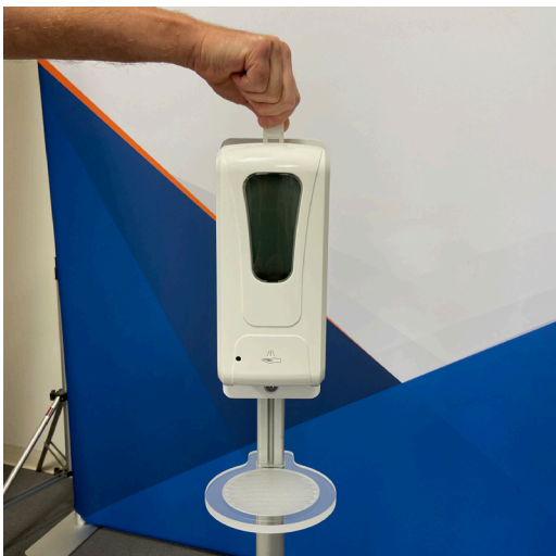
9) Open dispenser by inserting key and pushing down.