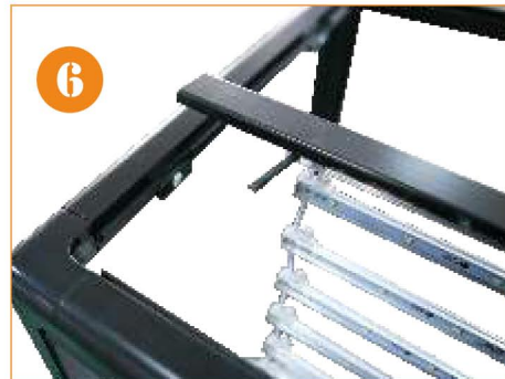
6. Hang the lights like this