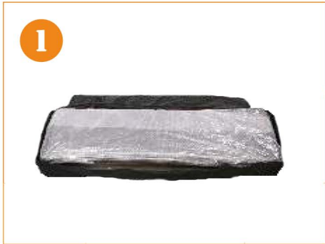
1. All of the components of the LBC1G are enclosed in the soft carrying case.