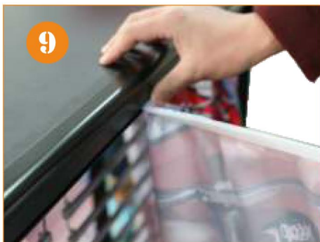
9. Install the graphic with silicon