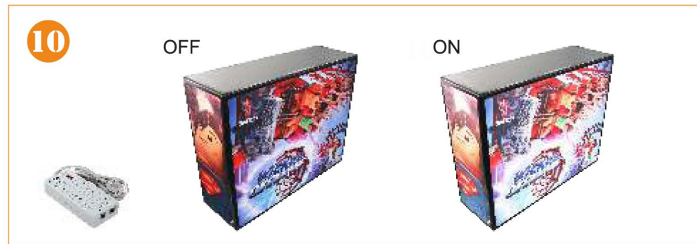
10. The finished light box should look like this