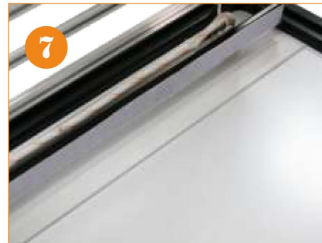
7. Attach the bottom aluminum bar's male to the velcro on the base