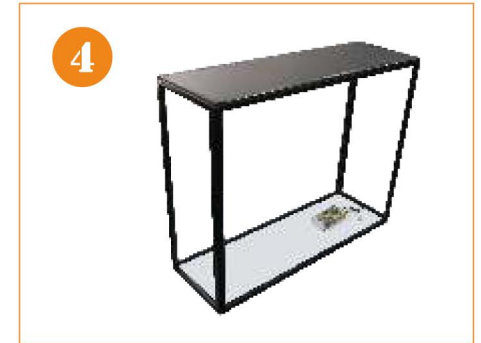
4. Put the top whole pcs on the 4pcs poles