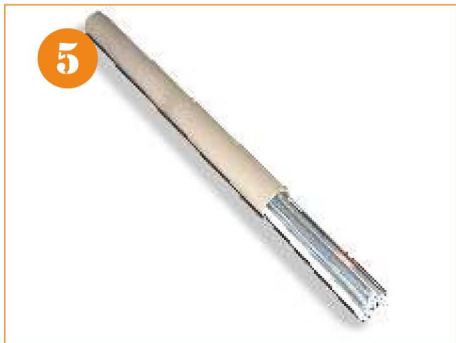
5. Take out the LED light