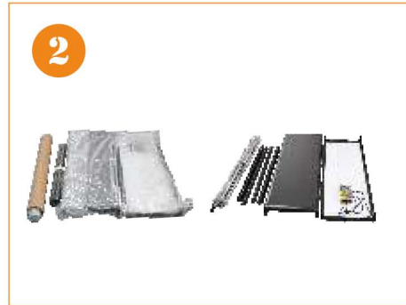
2. Take all the Components out of the bag.