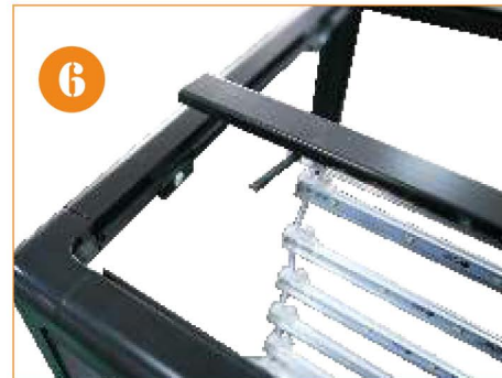
6. Hang the lights like this