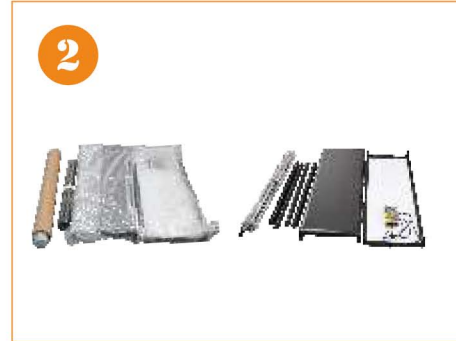
2. Take all the Components out of the bag.