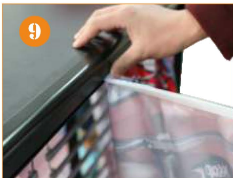
9. Install the graphic with silicon