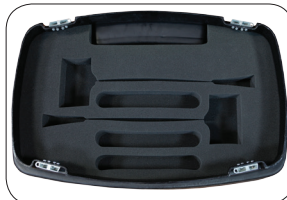
Foam padding for lights