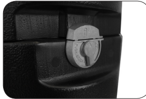
Push & turn locking mechanism