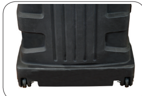
Recessed wheels and handle