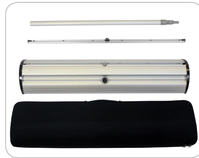
integrated pole storage