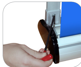
New Banner Stand Accessories: easy connection with cam lock and channel