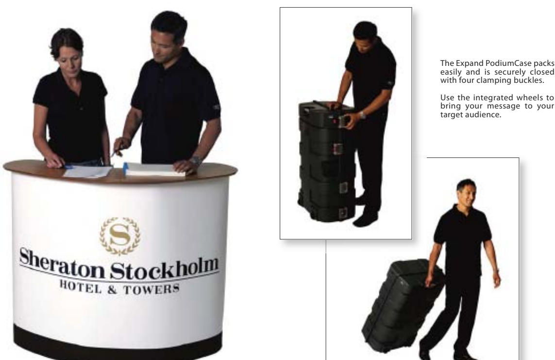
easily and is securely closed with four clamping buckles.

Use the integrated wheels to bring your message to your target audience.