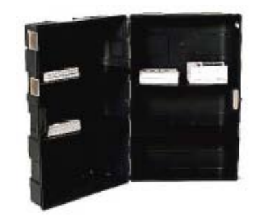
A rear view of the Expand PodiumCase showing the optional shelving. These shelves keep your extra items out of site from your customers.