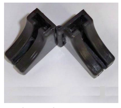
TOP HINGE Use to join two hinge panels at top of wall. Do NOT use on bottom row of panels.