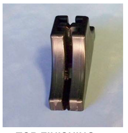
TOP FINISHING Use to join two panels at top of wall. Do NOT use on bottom row of panels.