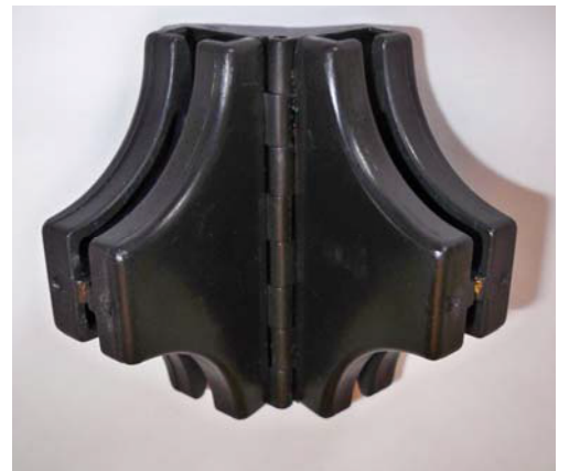
FULL HINGE connector Connects two panels to create angles in wall. Use on bottom row of panels.