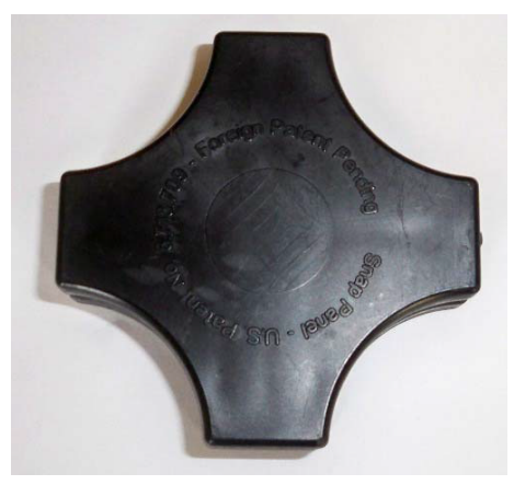
FULL SOLID Use to join two panels to create a straight wall. Use on bottom row of panels.