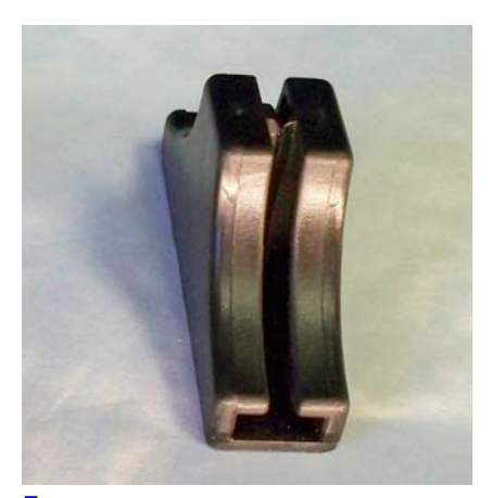
END FINISHING Use at end of wall for a smooth edge. Do NOT Use on bottom row of panels.