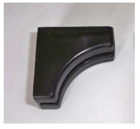
■ TOP CORNER Use this connector on top corner of wall for a smooth edge. Do NOT Use on bottom row of panels.